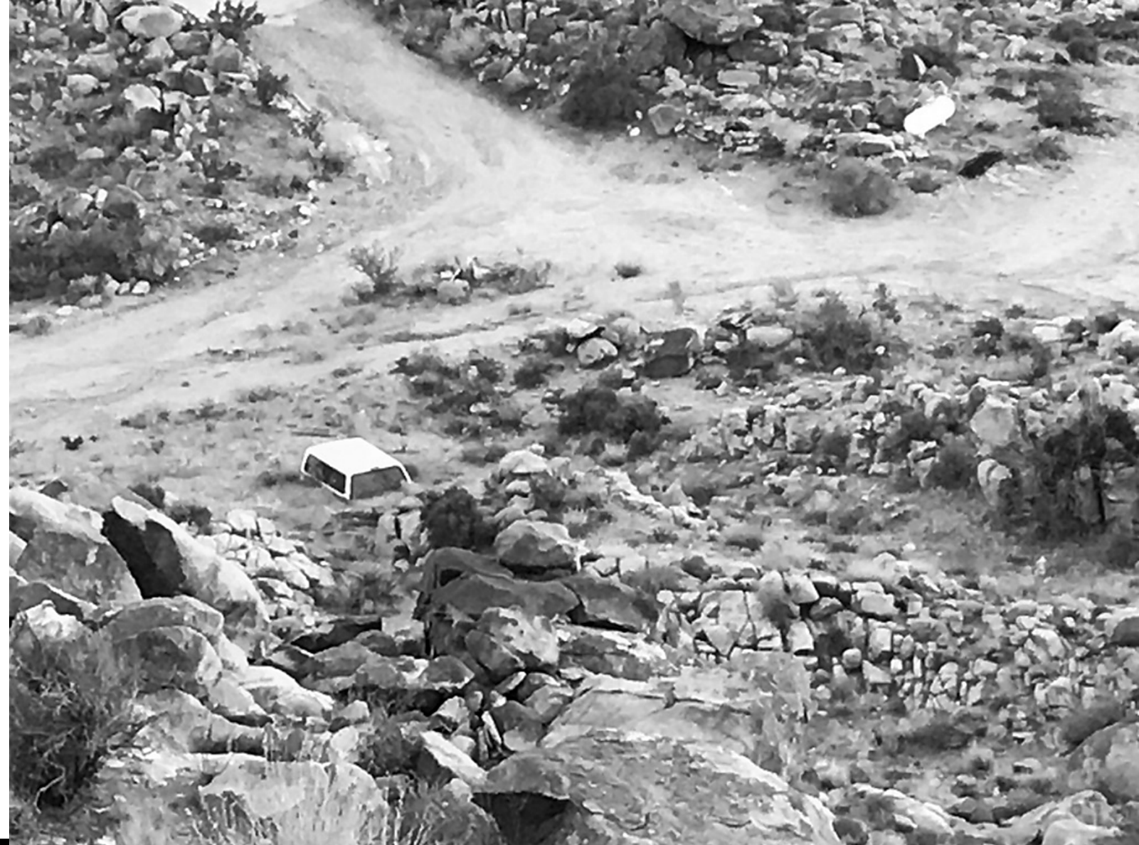
«Zip: 92252», Fiona Haines

Empire II is a spontaneous reflex point, a hot eye that reflects on the elusiveness and temporality of the digital image, interweaving